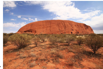
Ayers Rock 'Uluru' public domain